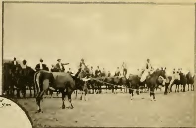
DRAGGING STEER TO CORRAL